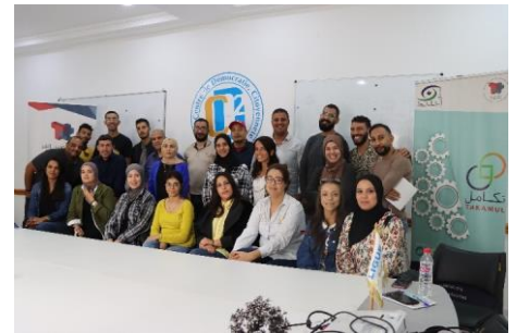
Training session for 40 young people to develop skills in line with labour market needs, Kef, October 2022.