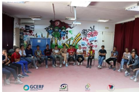
Identification and selection of at-risk youth aged between 14 and 18 and meeting with parents of youths, Tunis Region, October 2022.

Individual: A project supporting teenagers aged 14 to 18 who have dropped out of school, by providing them with individualized support enabling them to return to school, access vocational training or, for the older ones, integrate into the job market. The objective is to give these young people prospects for the future and to regain their self-confidence before they are tempted to join VE groups.