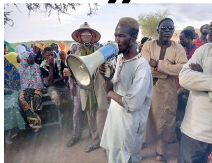
Awareness session by delegates, Burkina Faso