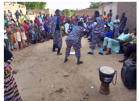
Participatory theatre, Niger