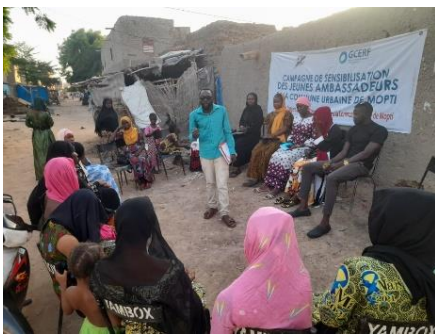
Awareness raising campaign, Mali