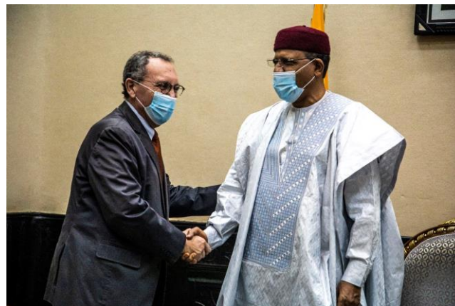
President Bazoum met with GCERF Chair and Executive Director and Head of Portfolio Management Unit, Niamey, March 2022