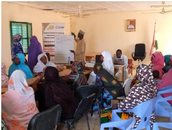
Income generating activities (IGAs) training for women, Bibiyergou

GCERF will mobilise and invest up to USD 10 million to meet these objectives in a minimum period of three years. GCERF will prioritise resilience and prevention programming, including cross-border projects, that meet these objectives – all within the scope of regional and national NAPs and equivalents in order to achieve its overarching objective of supporting the emergence of anchors of stability and resilience.