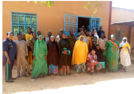
Training with youth and women local leaders on communication techniques for the PVE, Torodi