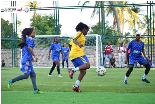
FC Lady Legends in action in Kashmir

For the first time, the county government has allocated budget (27 million KES) to PVE initiatives for the 2023 fiscal year to fund county-level initiatives on deradicalisation and substance abuse as well as in the prioritised CAP pillars of education, economic, and ideology.