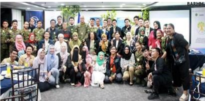
Photo: Peace Education Leadership Formation Course for municipalities in BARMM, Commanders of the Armed Forces of the Philippines, and partners from various BARMM ministries.