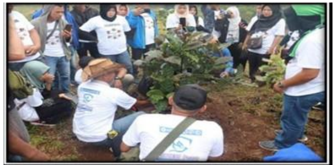
Photo: Livelihood Training and Field Exposure on Coffee Plantation for Farmers in Matanog MDN.