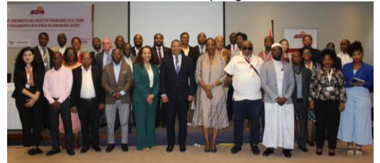
Official launch of the programmes

The launch was followed by a PCVE training attended by all principal and sub-recipients as well as government representatives, delivered by the Institute of Economics and Peace