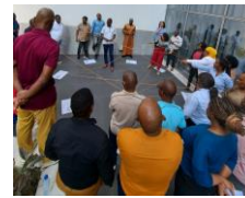
Positive Peace training