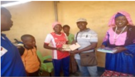
School supplies for pupils, Dori

I want my testimony to serve as a reminder that we need your support to rebuild our lives so that we can continue to learn and grow despite the trauma we have experienced. I would like to thank everyone who has contributed in any way to getting the school going again."