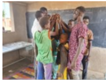
Educational and self-protection sessions for street children, disabled children and children on the move, Djibo.