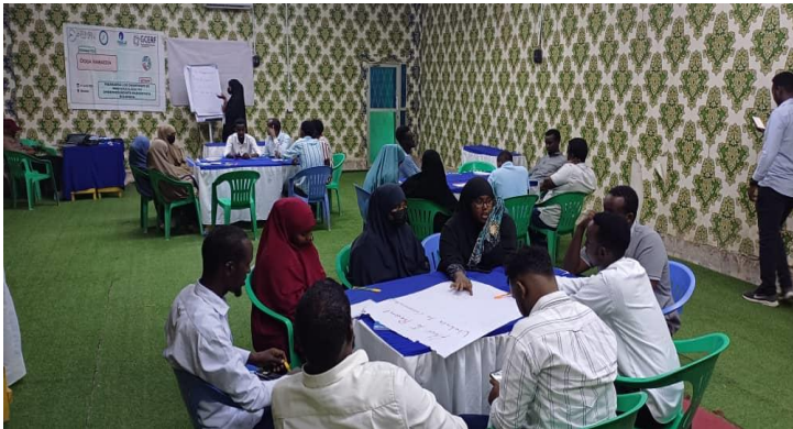
Leadership coaching for women and youth leaders

These sessions covered various topics, including conflict resolution, communication and leadership skills. Following the training, participants have reported significant skill development, indicating that they have acquired new skills in dialogue, mediation and facilitation to address conflict and promote peace in their communities more effectively.