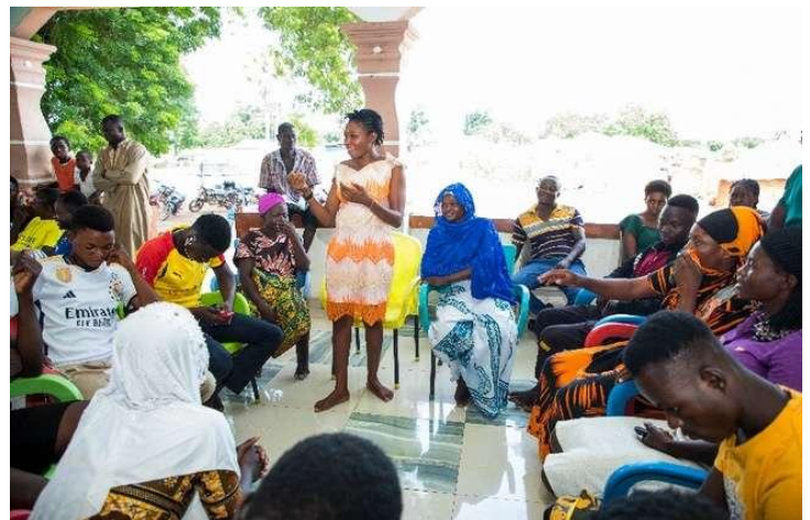
Digital literacy club executive engaging members in Garu