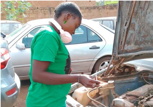
A young girl trained in car mechanics apprenticeship programme

I also want to be able to get a driving licence, and I'm counting on AJBF and its technical and financial partner to help me get one, to give my apprenticeship an even bigger boost. I can't finish without thanking AJBF and its partner for believing in me. I won't let you down.