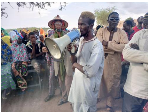
Awareness session by delegates.

GCERF will mobilise and invest up to USD 10 million – in the Sahel region – to meet these objectives in a minimum period of three years. GCERF will prioritise resilience and prevention programming, including cross-border projects, that meet these objectives – all within the scope of regional and national NAPs and equivalents in order to achieve its overarching objective of supporting stability and resilience.