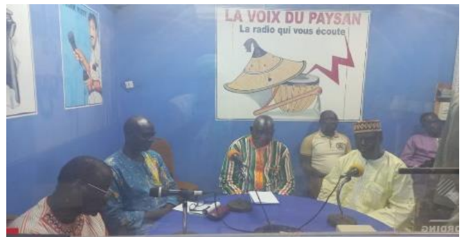
Awareness-raising radio programmes on social cohesion and living together.