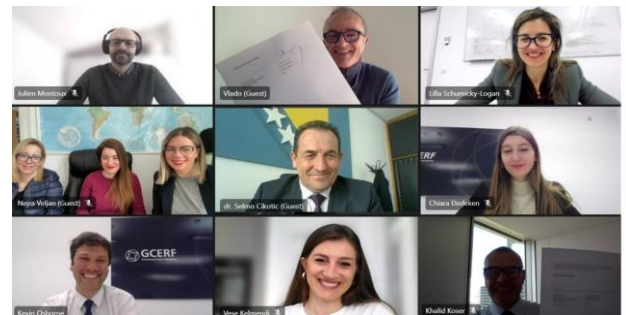
Photo: Virtual grant signing ceremony, March 2022