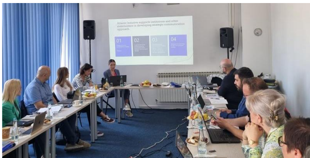
Photo: At the Proposal development workshop, May 2022