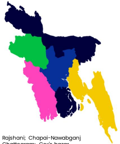
■ Rajshahi; Chapai-Nawabganj ■ Chattogram; Cox's bazar ■ Khulna; Satkhira ■ Greater Dhaka; Dhaka